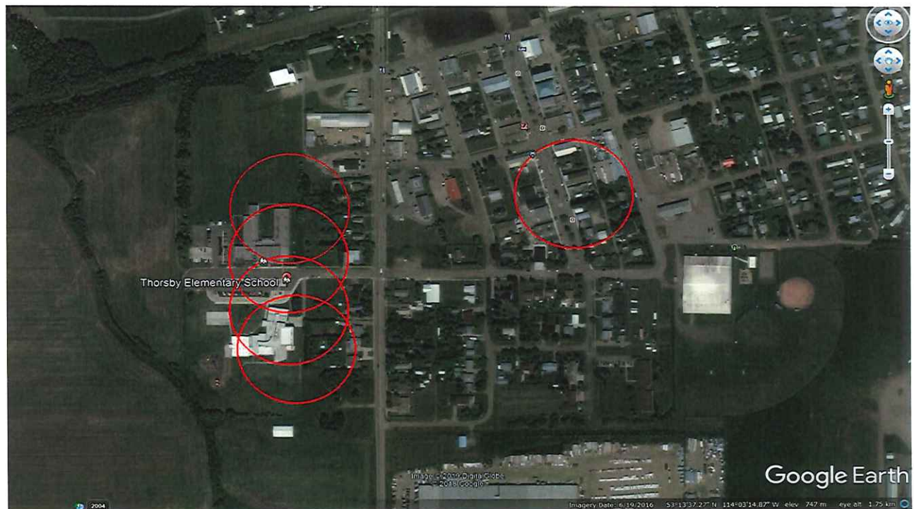
Figure 9.1(B) 1 displays the map showing area in C1 Commercial where cannabis sales may not be located